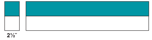
2½" Figure 2 Cut ninety 2½" units.